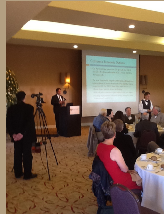
3rd Annual Economic Forecast

2012 was an exciting and productive year. From government affairs, to education, to advocacy in the community, SCCBC continued to uphold its mission of supporting economic vitality in Santa Cruz County through private/public partnership. With the support of our membership, and in keeping with our core values of providing a strong, unified “business-centric voice,” SCCBC was able to accomplish the following during the last calendar year: