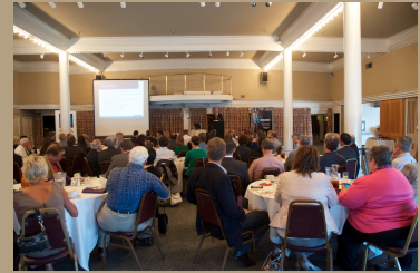
National Economic Forecast

Each year, SCCBC hosts educational forums that provide our local business community with the opportunity to hear experts discuss issues that have major economic impacts. While mostly centered on local topics, these events also look at broader issues outside of Santa Cruz County. Each forum saw a capacity crowd comprised of SCCBC members, public officials and other representatives from the local business community.